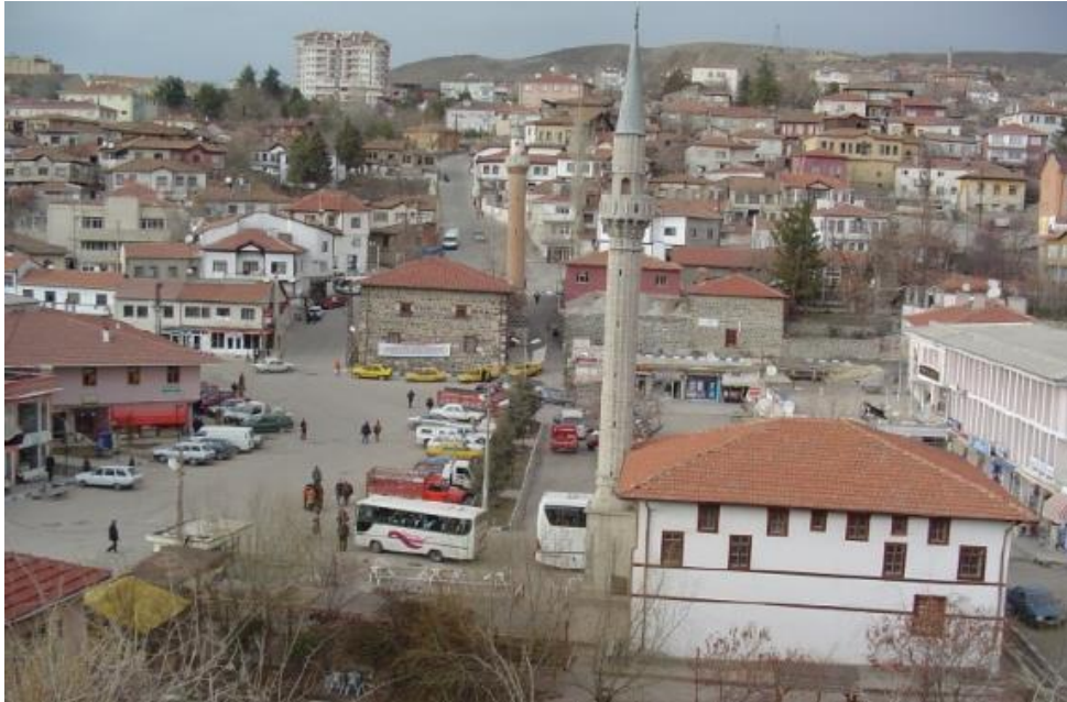
Figure 2. Square of Ayas District, Ulu Mosque and Seyh Muhittin Mosque [6]

Within the scope of this study, the architectural features of the Seyh Muhittin Mosque (Figure 2), located opposite the Ayas Ulu Mosque in the square of Ayas District, were investigated in terms of traditional and monumental architecture by archive research and literature studies. Also, land surveys were conducted on the building and the restoration practices in 2018-2019 were discussed. The survey, restoration and restitution projects of the building were obtained from the Ankara Directorate of Foundations and the restoration applications were examined on site. During these studies, care was taken not to damage the originality of the structure and to make application by evaluating the data obtained.