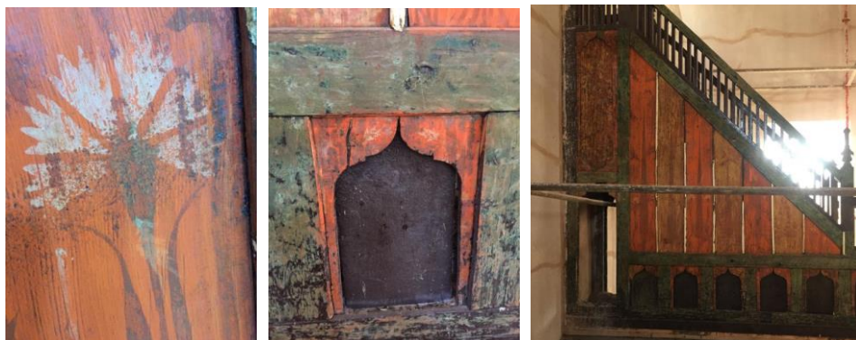
Figure 15. Cleaning the oil paint in the minbar [16]

In the approved restoration project; It is envisaged that the paint layers applied in layers over time prevent the perception of the plaster mihrab motifs to a great extent, and therefore, paint cleaning is performed with suitable methods in order to reveal the original surface. In this direction, firstly mechanical cleaning has started in plaster mihrab. During the cleaning of the paint, different colors of ochre paint were found in the lower layers (Figure 16). For this reason, the cleaning activities were carried out more precisely, paint cleaning was continued with paint remover and scalpel and orche paint was determined in most of the mihrab. After the cleaning works were completed, the fractures and cavities in the mihrab were consolidated by injection (Figure 17). Afterwards, completion and revitalization was done with orche.