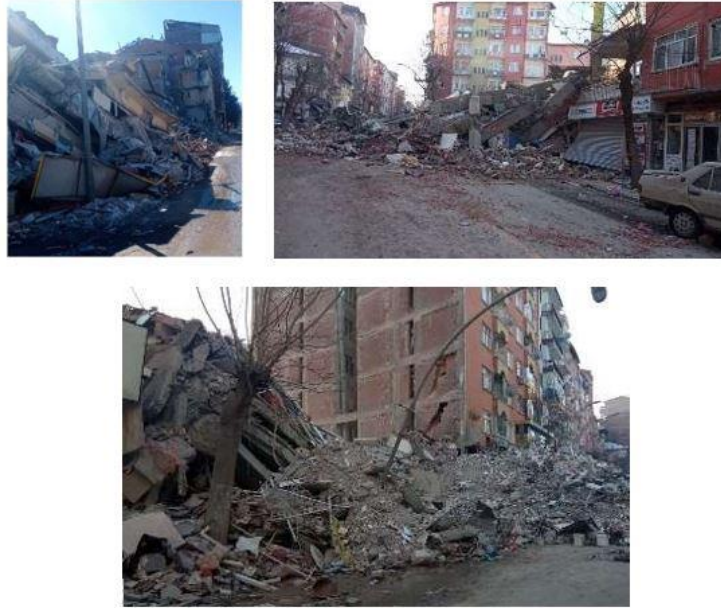
Figure 11: Weak column-strong beam damages