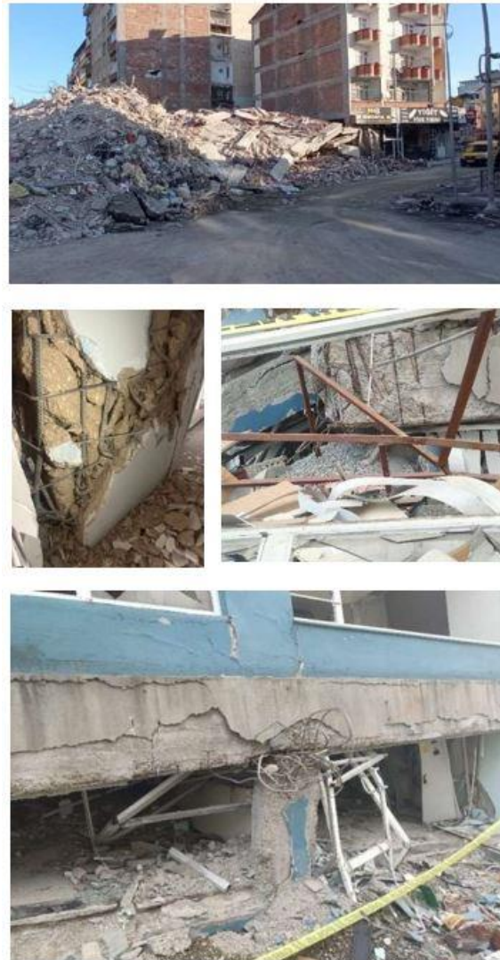
Figure 14: Material problems

earthquakes. The use of coarse aggregates in buildings has been widely observed, and it has been realized that concrete burns and brittle fractures occur because it is not watered (Fig. 14).