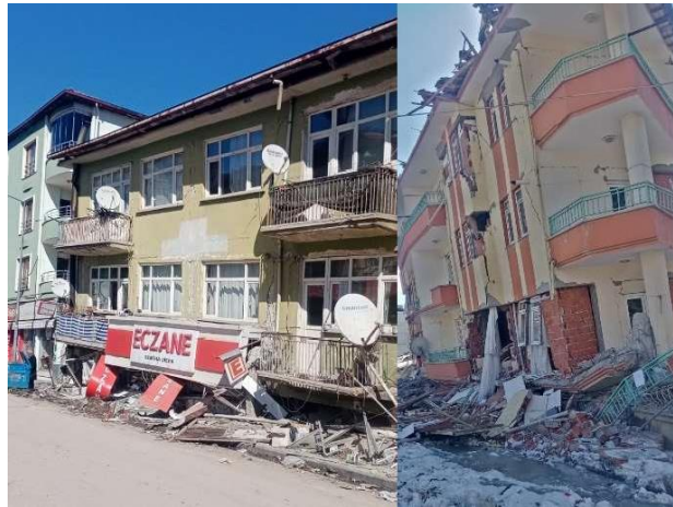
Figure 7: Soft storey damages in Malatya

cause critical conditions on earthquake behaviour of building. The height difference between the floors is a remarkable one among them. The ground floor of a building is generally designed as higher than the upper floors due to the user requirements. This causes stiffness losses and more displacement in the ground storey. Because, the cross sections of the columns are kept in same size in the ground floor even though there is a height difference is created between the two floors. Therefore, it causes a difference in rigidity or stiffness between the floors. This type of floors is called as the soft storey. It usually occurs due to the architectural requirements. For instance, using open ground storey such as shops, showrooms, banking halls create severe damage. Because, while a great storey drift occurs in the ground floor, the upper floors move like a diaphragm. High stress concentration occurs along the connection line between the ground and first floor that leads to distortion or collapse in structures (Arnold, 2002). The buildings displayed in Fig. 7 were severely damaged due to the weak storey problem.