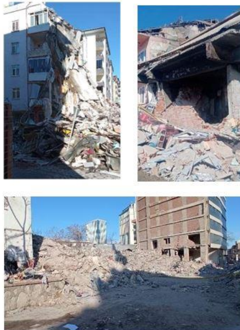
Figure 12: Seismic pounding damages

Seismic pounding is a significant design problem that causes serious damage and destruction in buildings under earthquake loads. It commonly occurs due to the insufficient seismic gap or no gap between two adjacent buildings. A sufficient amount of earthquake joints should be left to prevent buildings from colliding, taking into account the floor drifts of the building during an earthquake. If the size of the seismic gap is insufficient based on the expected storey drifts, pounding between adjacent or nearest structures may occur. Some of the seismic pounding problems observed after the Kahramanmaraş earthquakes in Malatya were illustrated in Fig. 12.