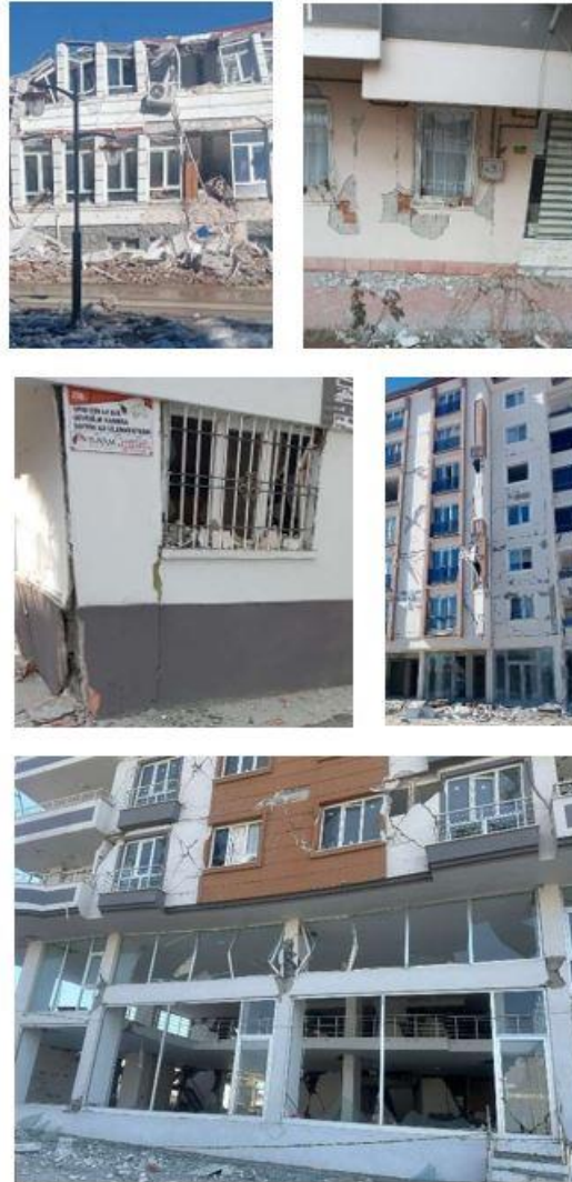
Figure 10: Short column effect