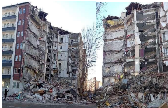
Figure 9: Insufficient design of structural elements