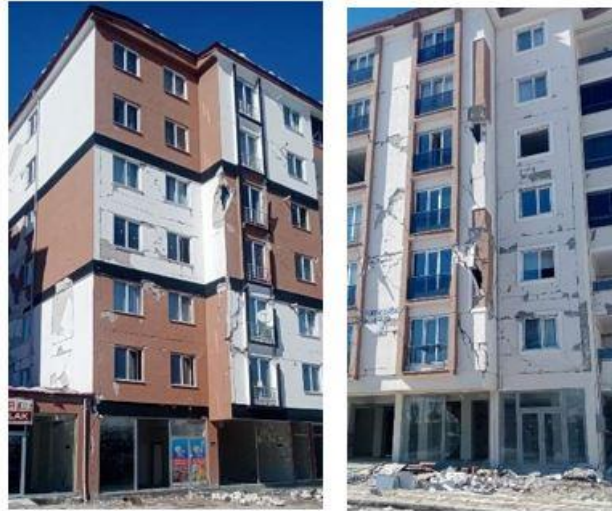
Figure 5: Projection damages in Malatya