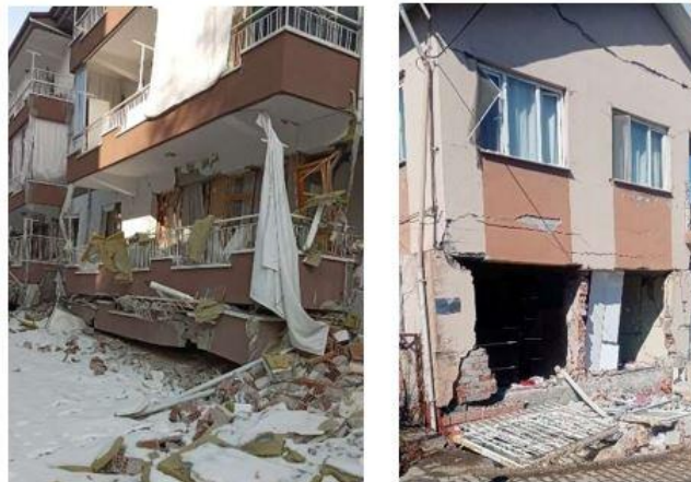
Figure 6: Weak storey damages in Malatya

The weak storey irregularity is defined in the TBEC that in reinforced concrete buildings, the case where in each of the orthogonal earthquake directions, Strength Irregularity Factor \eta_{ci} , which is defined as the ratio of the effective shear area of any storey to the effective shear area of the storey immediately above, is less than 0.80. If the ratio is between 0.8 and 0.6, there exists weak storey irregularity in structure. But, if it is less than 0.6, the structure must be redesigned until appropriate range of values are gained. This irregularity is related on vertical configuration issue in which there is a major reduction in strength between storeys. Although it is so dangerous when it occurs at ground storey due to the greatest load accumulation at this storey, it can be observed at any storey of a building. This irregularity generally occurs due to the lesser strength or major flexibility between stories. If all stories of the building are nearly equal in terms of strength or stiffness, earthquake forces can be distributed nearly equal to each storey under earthquake loading. The buildings illustrated in Fig. 6 were severely damaged due to the weak storey problem.