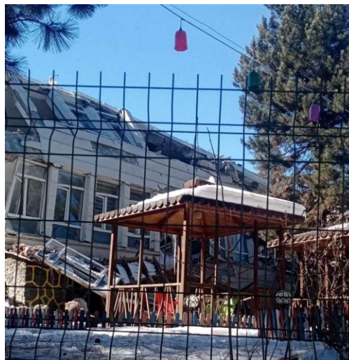
Figure 4: Floor discontinuity damages in Malatya

The floor discontinuity is described in the TEBC as the case where the total area of the openings including those of stairs and elevator shafts exceeds 1/3 of the gross floor area or the cases where local floor openings make it difficult the safe transfer of seismic loads to vertical structural elements and/or the cases of abrupt reductions in the in-plane stiffness and strength of floors. Floor discontinuity caused less damage than other irregularities, especially when heavily damaged or collapsed buildings were examined. The building in Fig. 4 was severely damaged due to the distribution of structural elements between floors and floor discontinuity due to the local floor openings that make it difficult the safe transfer of seismic loads to vertical structural elements.