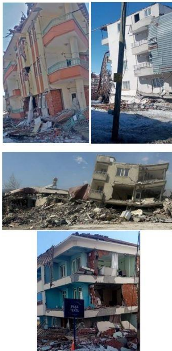
Figure 13: Soil type related problems

Many buildings are damaged in earthquakes due to poor ground structure in Turkey. Local soil types are divided into six main groups in the TEBC, named from ZA to ZF, from good ground to poor soil. The soil type ZA consists of solid hard rock and ZB consists of slightly weathered, medium- solid rocks. Besides, ZC comprises of considerable dense layers of sand, gravel and hard clay or weathered, highly fractured weak rocks. ZD consists of medium firm, firm sand, gravel or considerable stiff clay layers. Moreover, ZE comprises of loose sand, gravel or soft-solid clay layers. ZF refers to grounds that require site-specific research and evaluation. Buildings with ground liquefaction generally have this soil type. Some of the soil type related damages noticed after the Kahramanmaraş earthquakes in Malatya were shown in Fig. 13. In examinations carried out in areas where collapsed or heavily damaged buildings are located, the fact that there are slightly damaged neighboring buildings on the same ground layer shows that the demolitions are not only caused by the ground.