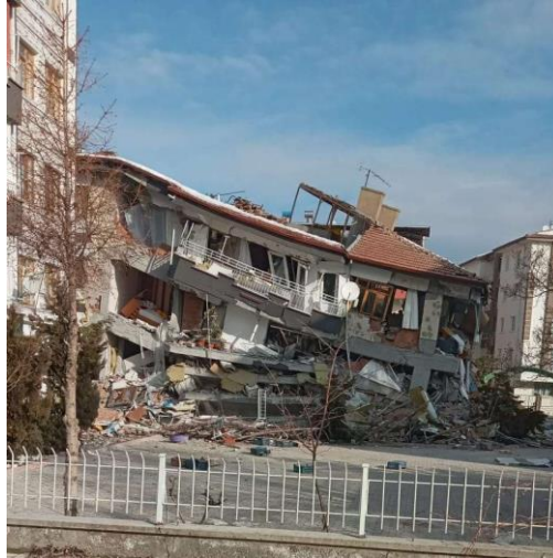
Figure 3: Torsional irregularity damages in Malatya