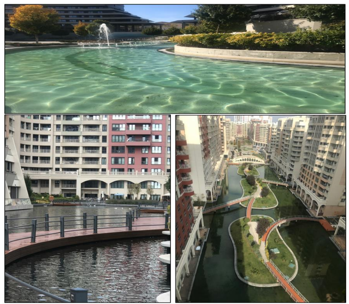
Figure 4. Use of water elements (Original, 2019)

The ecological pund facing to the backyard near the lake-houses ends in the gardens of the houses. The passages are placed around the pund, and a circular form island was designed with a sitting area in harmony with the passage ways. Gardens are designed between the blocks on the lowers sets of the area, designed as sets in line with the topography of the land, as well as involving water ducts in the design.