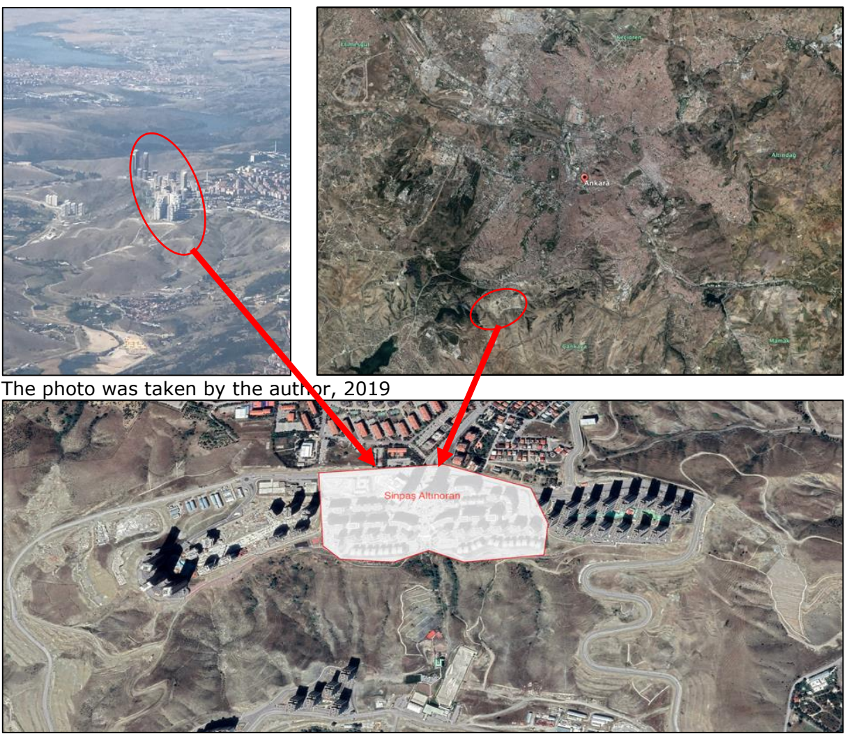
Figure 1. Research Area (Earth Pro, 2019)