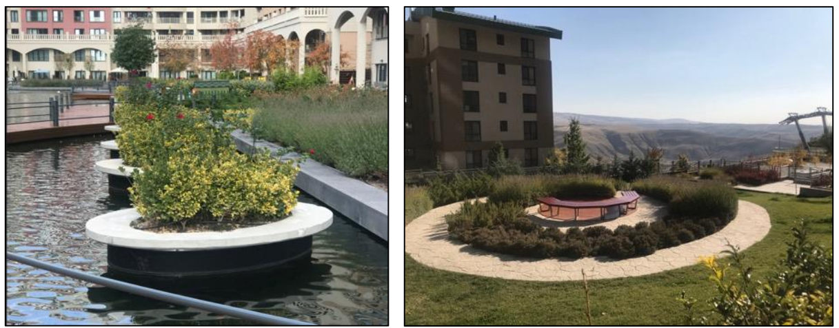
Figure 8. Use of Egg, oval forms in Landscape design (Original, 2019)

Oviforms were generally used in the landscape design. It was substantially used in the flower parterres placed in the islands, pund and gardens within the lake area.