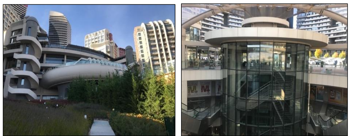
Figure 11. Interior-exterior relation / Spatial harmony (Original, 2019)