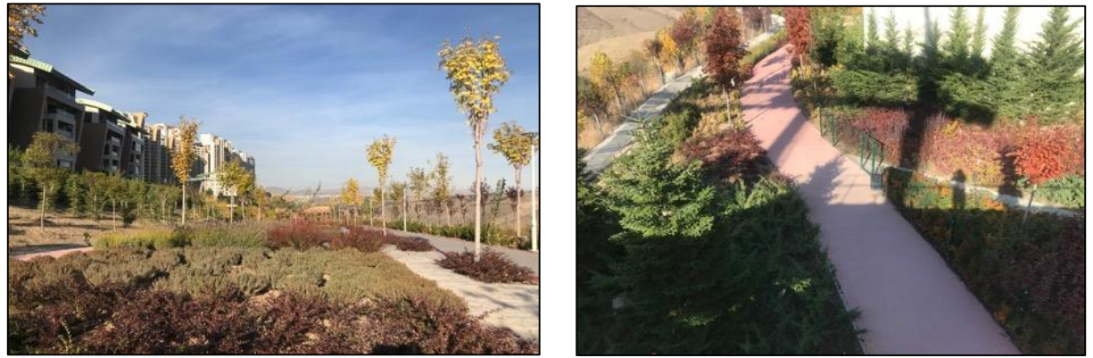
Figure 13. An example that is in harmony with the nature, Altınoran Residential Site, hiking track (Original, 2019)

the objective in mind to improve socialization (entertainment, resting, hiking, enjoying the view, trekking, etc.).