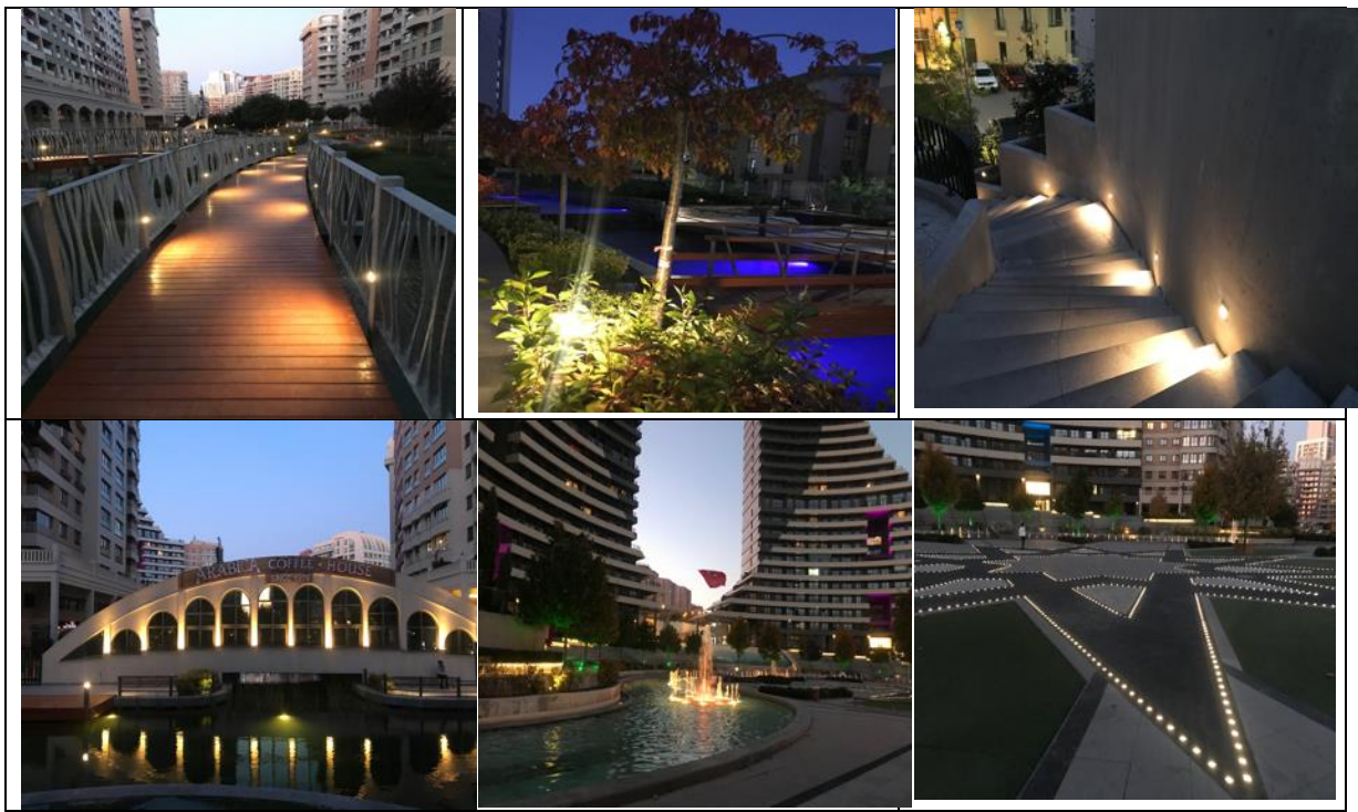
Figure 10. Use of Light and shadow / Reflected light / Light pools (Original, 2019)

Lighting is one of the most important factors required by people to maintain their life. People have the ability to perceive the physical space they are in through light, color, audio, temperature, humidity, air and odour. Since 95% of the information that people acquire through different perceptions is through visual perception, light is of crucial importance among these elements (Öztürk, 1992). Lighting systems are available in the project area. Various lighting options are included as Filtered and diffused light / Light and shadow / Reflected light / Light pools / Warm light / Light as shape and form headings. For example, in order to concretize areas such as passageways, connection roads, serial road lightning systems, light pools in the pools, along with the light reflection technique in harmony with the colors under the plant materials were utilized, as well as establishing a structure lighting system for creating a focal point in the facades of the structures.