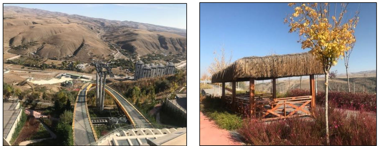
Figure 7. Scenic cruising points created in the walking area (Original, 2019)

There is a valley on the eastern section of the settlement plan, designed as sets using the topographical properties of the area. Hiking tracks and resting/viewing areas were created with a view to the valley in the set where the settlement has begun. Moreover, a telpher system was established for getting down to the valley, the Skywalk was integrated into the telpher system, thus building a terrace for viewing. Natural materials were used as structural process, as it was in Pergola.