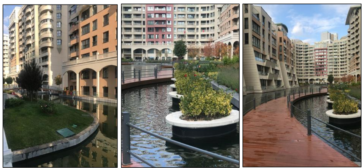
Figure 9. Use of arches and stright lines in structural design (Original, 2019)