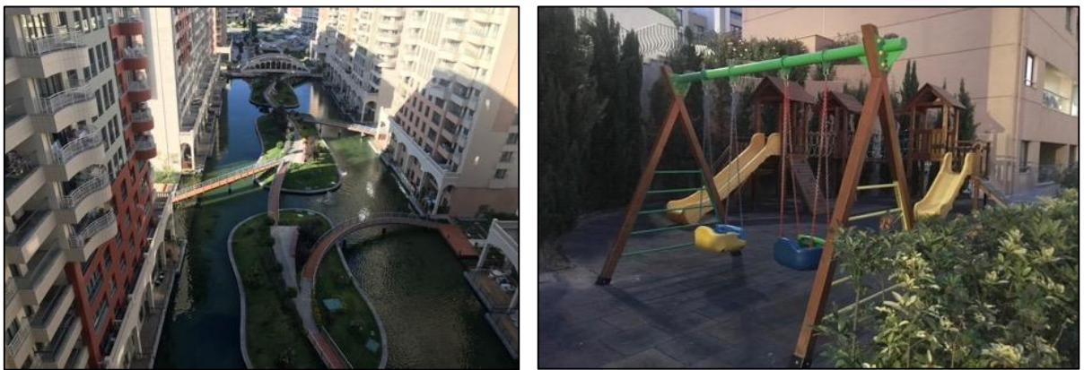
Figure 10. Transition fields / Bounded spaces (Original, 2019)

Taking the general design characteristic of the research area into consideration, it can be seen that it has a central-oriented planning scheme. The square is placed to the center of the area, while two wings are placed on the North-South direction. There are two towers at the square. Bounded spaces were designed in various parts of the site and various activities were projected to be carried out in these areas. In addition, playgrounds, basketball fields and recreation areas especially created for children are located in this area as well. Moreover, the transition roads and bridges are designed on the ecological pond and between the gardens, ensuring mobility and balance in the area.