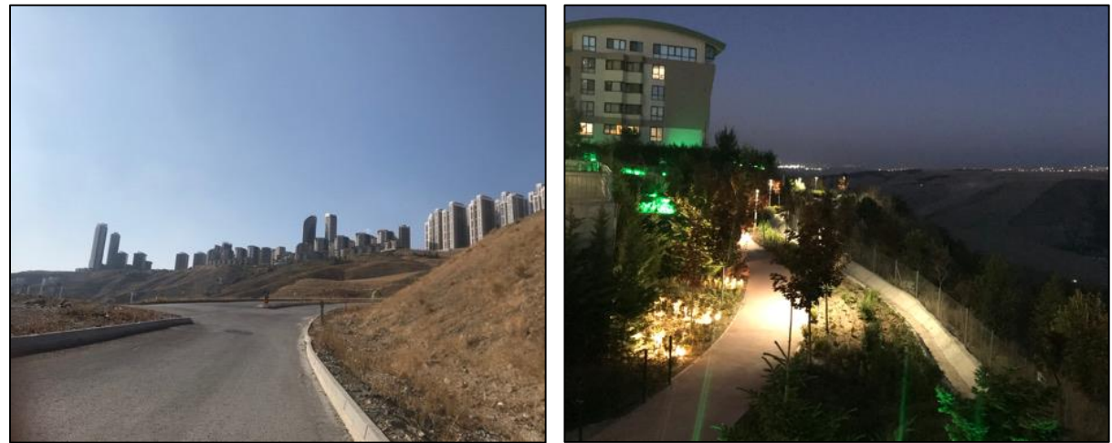
Figure 12. Topography and geographical location of the area (Original, 2019)

Altınoran Residential Site is located in a certain part of İmrahor Valley, where the altitude differences is relatively high on geographical aspect. It was built on a level area with a great view to the valley on the peak point of the sloping land within this part of the valley. Despite being located outside the city, Altınoran Residential Site is connected to the city centrum and other living areas through asphalt roads.