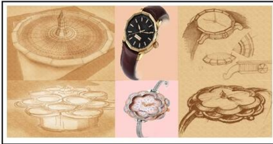
Figure 6 Watch design inspired by Rambagh palace