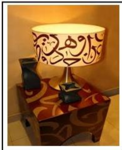
Figure 16 lamp unit product