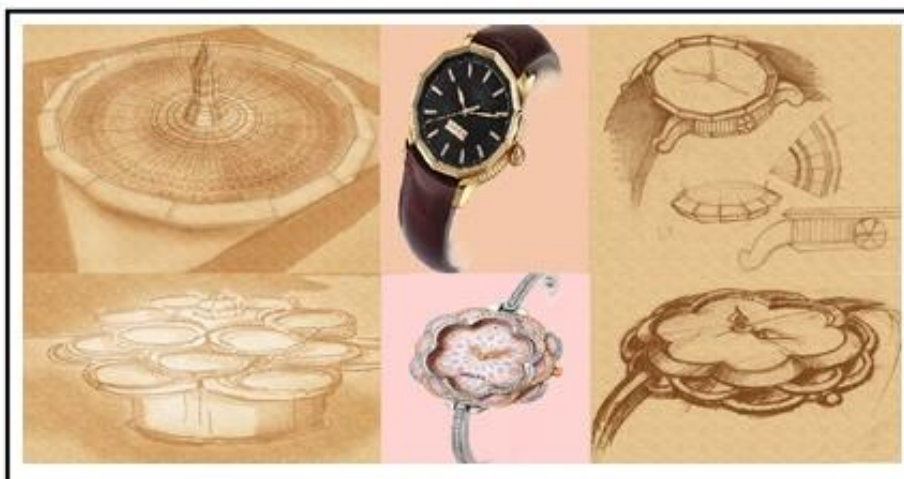
Figure 14 Watch design inspired by Rambagh palace