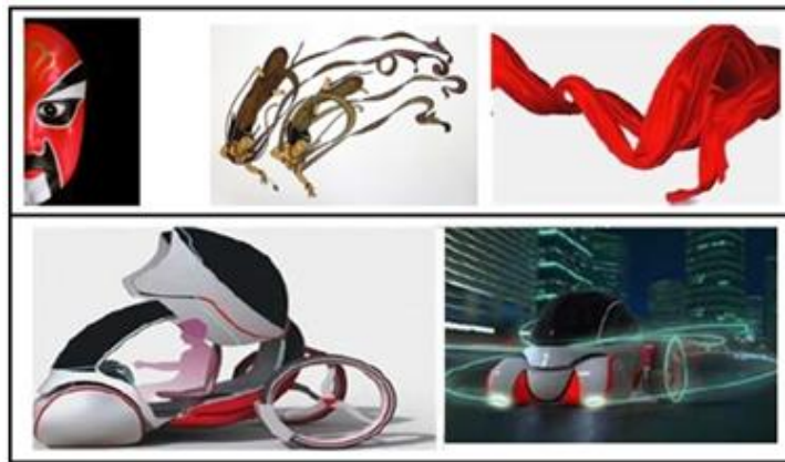
Figure 10 Car inspired by Chinese heritage