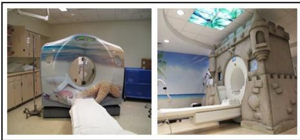
Figure 1 Two rays devices

Therefore, user centered design concept considers human and all his moral and material needs. Figure (1) shows two different designs of rays devices designed in a way that reflects the designer's ability to consider user's moral needs through form, texture and color to overcome the feelings of fear of those devices.