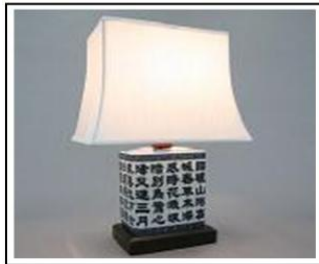
Figure 5 lamp unit with Japanese letters

Culture is created by groups of people who need it. Moreover, the whole society does not last and exist without culture that represents the life style of that society. In addition, culture does not exist exclusively in specific periods of time, and it does not disappear with the death of individuals as it is not the property of anyone. Therefore, culture is inheritable from one generation to another as long as societies exist. An example for that: using Japanese letters inside a lamp unit to make the Japanese citizen feel pleasure when learning his language through the product, figure (5).