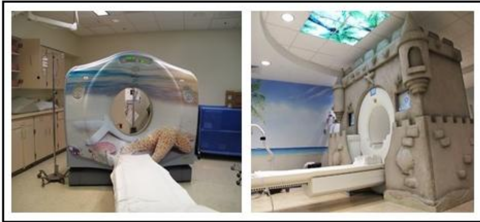
Figure 9 Two rays devices