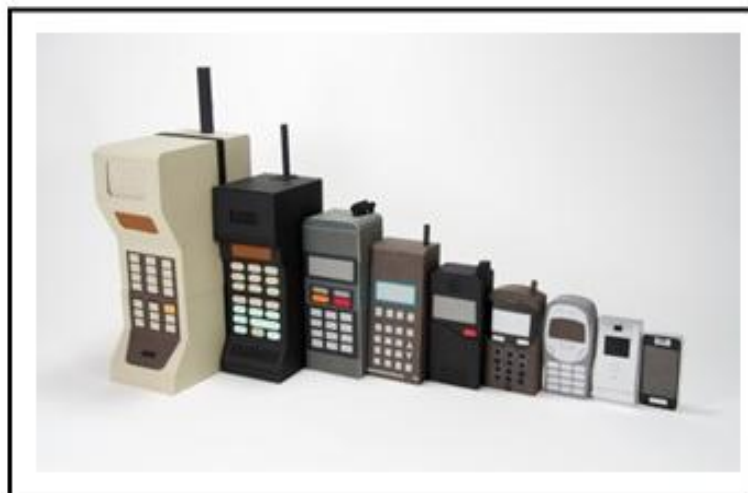
Figure 7 Development of mobile phone designs

There is no doubt that the recent development of communication technology has helped designers to anticipate the varied needs of users. Therefore, designers have developed products such as mobile phones. Figure (7) shows the added features, as well as the changes in form and size that enhanced mobile phones to make them more aesthetic and convenient.