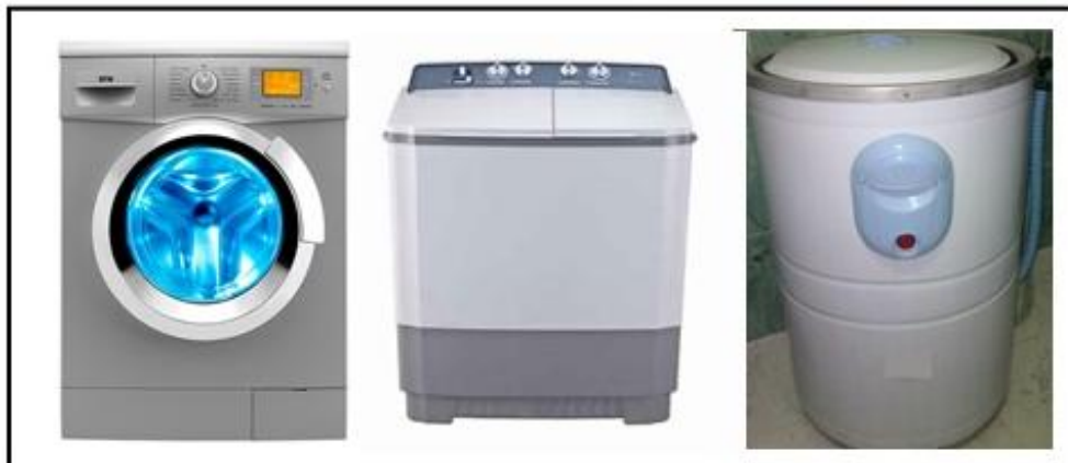
Figure 11 Washing machine (manual, half automatic, full automatic)