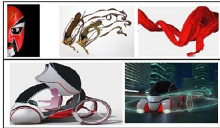
Figure 2 Car inspired by Chinese heritage