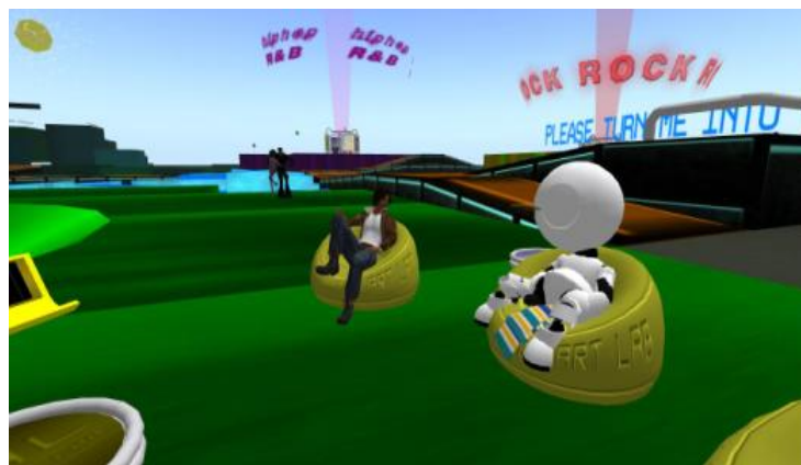
Figure 5. Interviewing with Shaggy Homewood at PAL's Electronica Zone

In the Metrotopia case, the design decisions were evaluated and agreed upon by the co-designers according to an official contract which gave Caitlyn the last word. The needs and interest of the research team had priority. The roles of each participant were decided in a more structured way, and within a strict time-schedule, because the research-