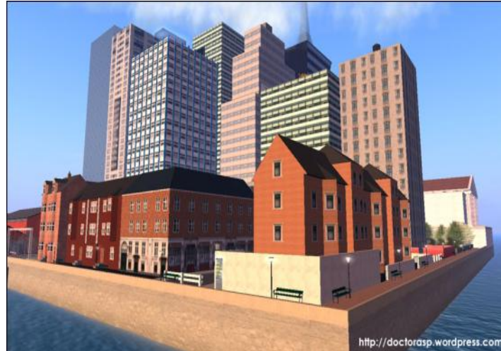
Figure 1. View from Metrotopia: The City of Superheroes and Heroines