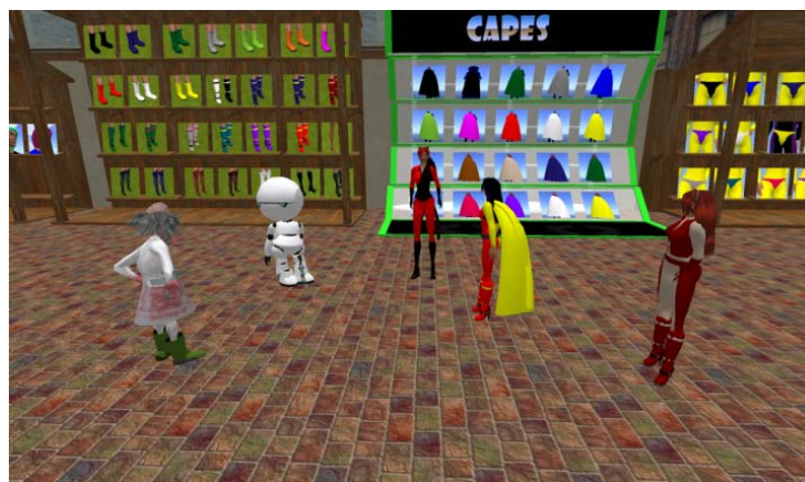
Figure 4. Metrotopia design team members in an inworld design meeting

potentials through collaborative action. Rhetorical intentions of the social actors diverge, and formations of design teams are often in flux. The design methods show variations depending on the structure of teams and preferences of each individual co-designer. Similarities also exist in terms of collaborative evaluation and modification of designs, and the ways in which the co-designers conceptualize the needs for avatar interaction. In both cases, several participants met in both physical and virtual places for different purposes during the process. In Metrotopia, the physical meetings were used for concept generation and project development (Figure 4). As mentioned above, the entire PAL team has never met in person, and all of their collective decision-making processes are organized in SL (i.e. Figure 5).