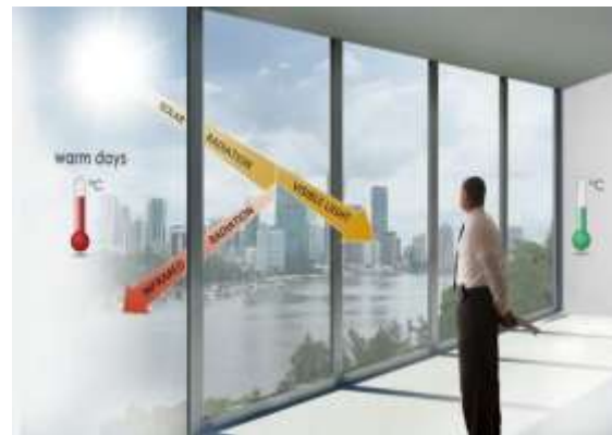
Figure (8) shows the use of smart windows in hot and cold climates.