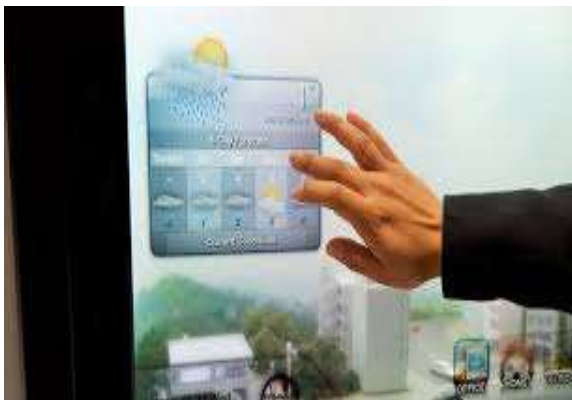
Figure (7) shows the control over the use of smart windows through electronic settings.

The applications of smart windows continue to evolve thanks to Smart Technologies. Recent studies demonstrate ongoing innovations in this field. A new development in smart windows enables users to customize the view from their residential unit. For example, a unit no longer needs to overlook the sea, a river, green spaces, or even snowy landscapes; smart windows allow users to change their view according to personal preferences. This innovation is especially useful in densely populated areas with closely packed buildings.