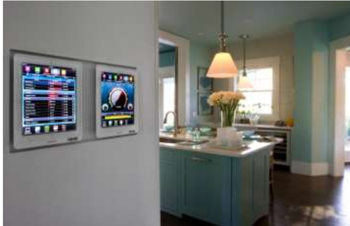
Figure (5) Smart Wall, Source: https://inno-vatech.com/service03/