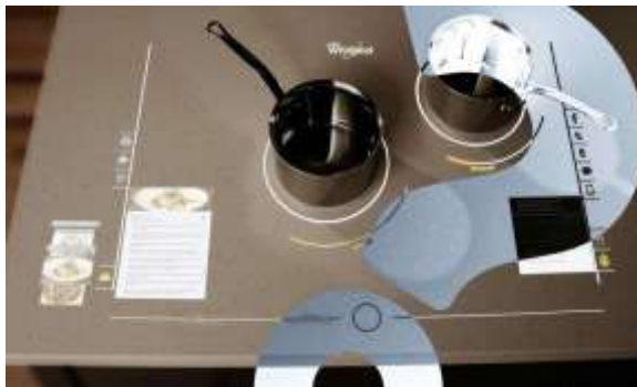
Figure (3) Model (A) of the smart kitchen table