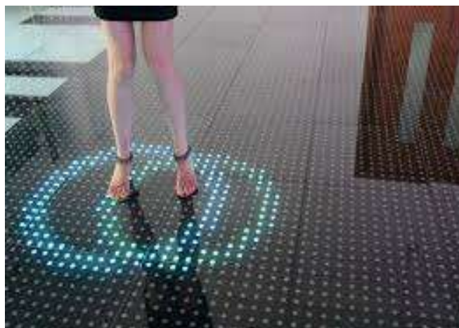
Figure (6) Smart Floor

The smart floor wall is one of the modern innovations in smart residential environments. It is distinguished by its ability to detect abnormal user behavior patterns within the indoor space. The system monitors and tracks any situation that could pose a problem and activates rescue procedures in the event of a fall or other emergencies. This functionality is achieved through sensors that detect the number, weight, shape, and location of objects and people, using foot pressure sensing technology. The smart floor wall represents one of the key technologies integrated into the design of residential spaces to enhance security and safety, and it is primarily implemented in smart homes (K. Yin & D. K, 2003, pp. 329–338) (Figure 6).