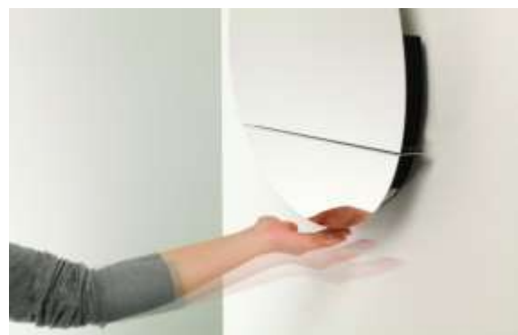
Figure (2) Smart mirror