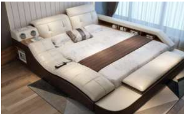
Figure (1) Smart Bed Source: https://www.aliexpress.com/item/1005003784596859.html?gatewayAdapt=ara2glo