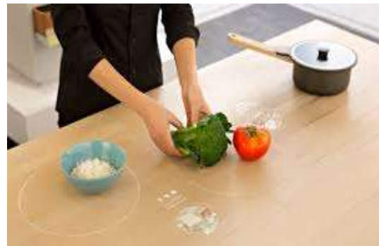
Figure (4) Model (B) of the smart kitchen table